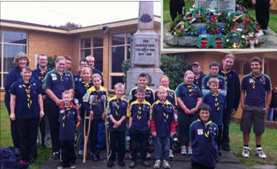
Pictured after the Anzac Day ceremony are: