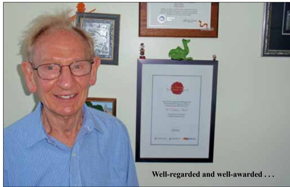
Well-regarded and well-awarded . . .

computers, three telephones and piles and piles of paper for just one doctor!