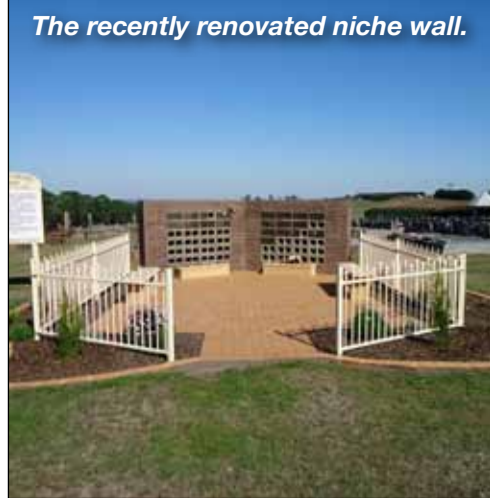
The recently renovated niche wall.