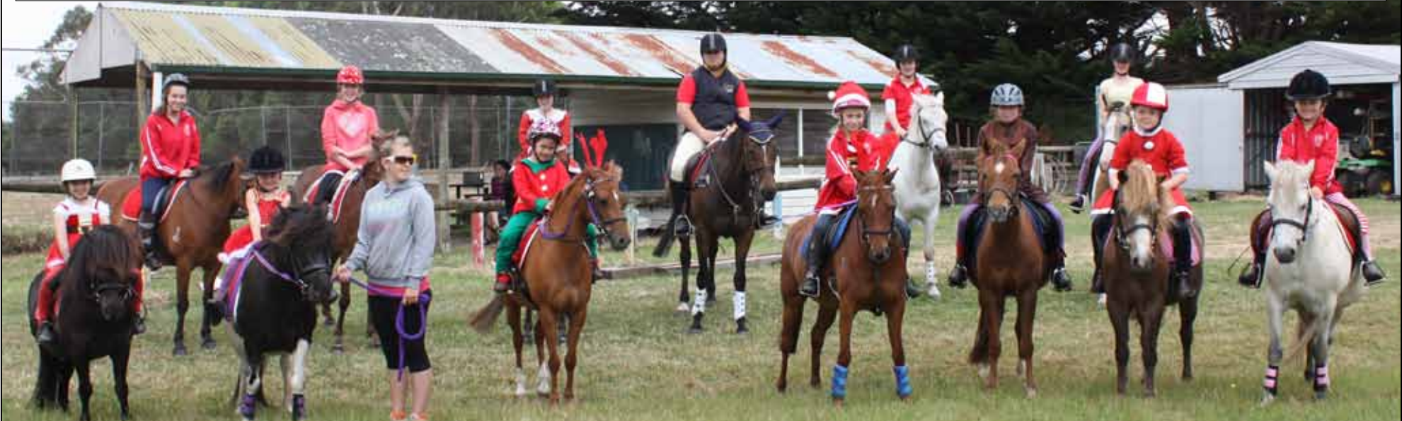
Pony Club members at the Christmas Dress Up Day Rally, December 2011.